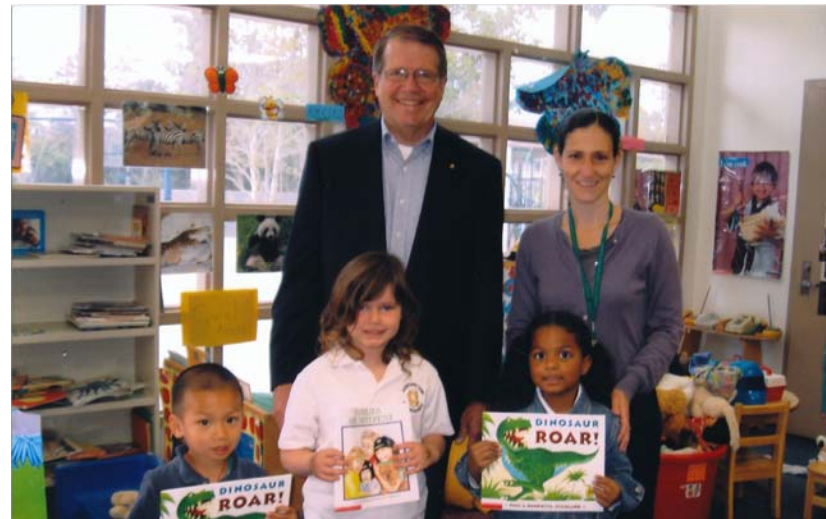
Longfellow Elementary School, Pasadena, California, June 2010

A Community Service Program Sponsored by The Rotary Club of San Marino And the San Marino Rotary Foundation In Cooperation with Scholastic Books Publishers