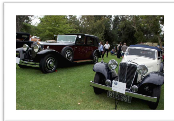
San Marino Motor Classic – our major fundraising effort